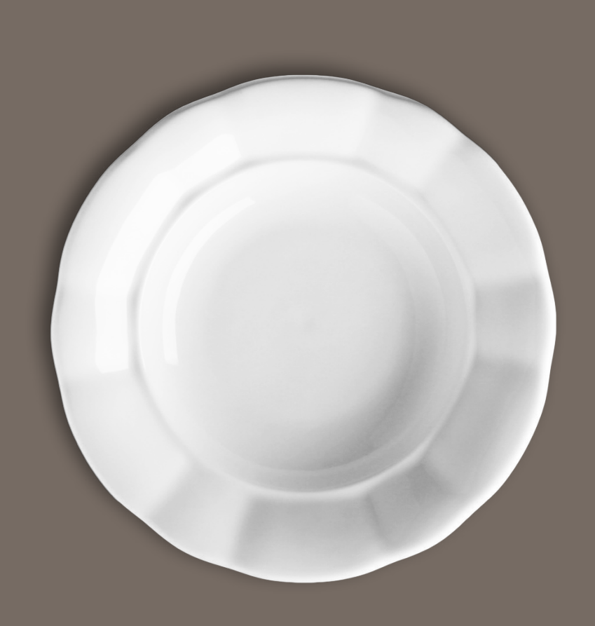
BEN1924 deep plate 24 cm